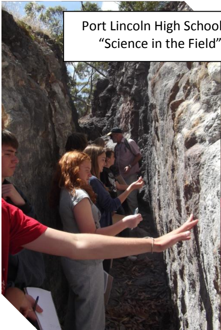
Port Lincoln High School students on “Science in the Field” trip 2013

A total of $25,000.00 was disseminated to 6 projects identified in Port Lincoln and Ceduna. Fuel vouchers valued at $15,000 were distributed to the Lower Eyre Red Cross Community Transport Service ($7,000), Community House Port Lincoln ($1,000), EPCF ($2,000), Far West Football League ($1,000), and Ceduna Red Cross Community Transport Service ($4,000). Port Lincoln High School received funding of $10,000 for 2 “Science in the Field” projects.